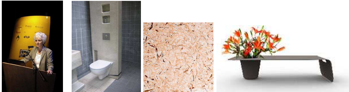
Market development nature fibre composites: performed for NPSP Nabasco® (Nature Based Composites), with: Nedtrain, Leolux, RAU Architects, Van de Bilt Seeds and Flax, ATO Compose, Springtime and IVAM.