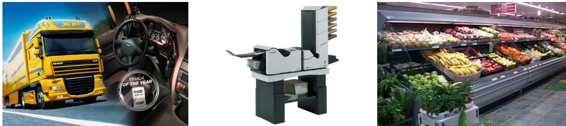
EcoDesign trainings executed for: DAF Trucks NV, Mokveld Valves, Neopost Technologies, Dutch Cooling Technical Industry (NKI) with Association FME-CWM.

Training with practical examples and exercises that lead to concrete improvement options for existing products and ideas for sustainable innovations. Partners for Innovation has trained more than 100 participants (designers, constructors, etcetera). After the training participants are capable to apply the Ecodesign tools in their daily practice.